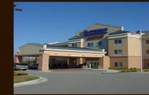
Fairfield Inn & Suites