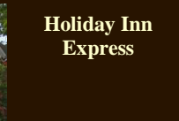
Holiday Inn Express

Frankfort/Franklin County Tourist & Convention Commission 1-800-960-7200 * 502-875-8687 www.visitfrankfort.com