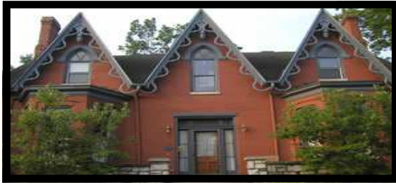
The Meek House 119 E. 3 rd Street 502-227-2566

Gothic Revival home. Spacious rooms. Quiet surroundings. Within walking distance of the State Capitol and historic downtown Frankfort.