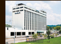
Capital Plaza Hotel