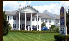
Best Western Parkside Inn