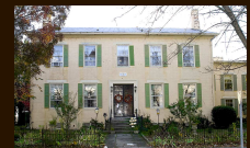
The Meeting House B&B