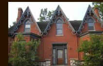
The Meek House B&B